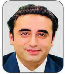
Bilawal Bhutto Zardari Federal Minister for Foreign Affairs