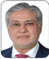
Muhammad Ishaq Dar Federal Minister for Finance